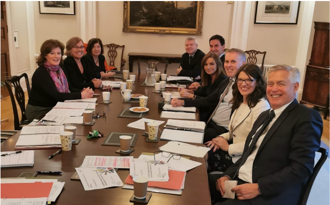
Commissioners met with the Permanent Secretaries Group

In 2019/20, Commissioners met and engaged with regulatory organisations and key stakeholders to ensure that they remain up-to-date on policy, case law and good practice and equipped with all relevant information in relation to recruitment in the NICS. This was invaluable as Commissioners reflected on strategic priorities, compiled strategic plans and delivered their statutory functions.